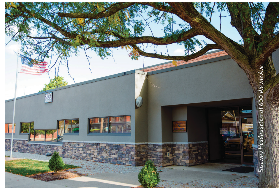
Eastway Headquarters at 600 Wynne Ave.